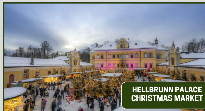
HELLBRUNN PALACE CHRISTMAS MARKET