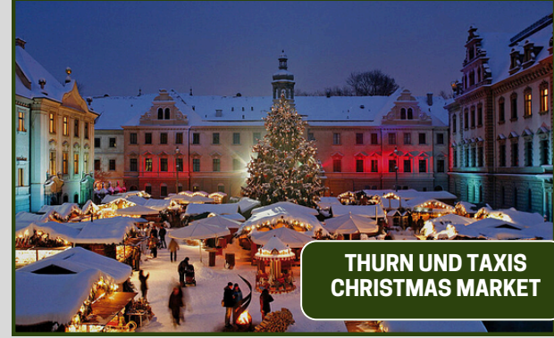
THURN UND TAXIS CHRISTMAS MARKET

SOME OF BAVARIA'S SPECIALTIES—BEER, SAUSAGE, AND PRETZELS. FOR THOSE IN A MORE FESTIVE MOOD, SPEND THE AFTERNOON AT BAVARIA'S MOST BEAUTIFUL AND ROMANTIC CHRISTMAS MARKETS AT THURN AND TAXIS , WHERE YOU CAN WATCH ARTISANS MAKE THEIR UNIQUE ARTS AND CRAFTS. (B, L, D)