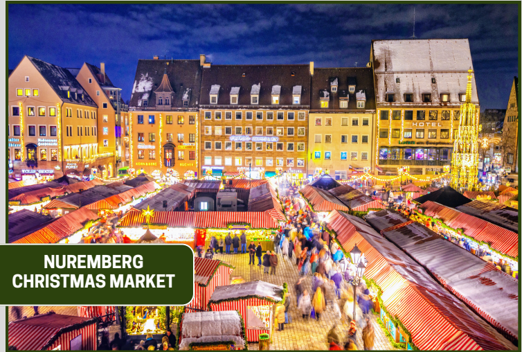
NUREMBERG CHRISTMAS MARKET

ENJOY A SCENIC MORNING CRUISE AS THE SHIP CROSSES THE CONTINENTAL DIVIDE VIA THE MAIN-DANUBE CANAL TO NUREMBERG . JOIN A CITY TOUR OF WWII HIGHLIGHTS AND WALK THROUGH NUREMBERG'S COBBLESTONE STREETS TO THE IMPERIAL CASTLE AND 900-YEAR-OLD CITY RAMPARTS. ALTERNATIVELY, YOU CAN TASTE YOUR WAY THROUGH THE CITY WITH A FRANCONIAN SPECIALTIES TOUR, WHICH INTRODUCES YOU TO BRATWURST, ROTBIER (RED BEER), AND LEBKUCHEN (GINGERBREAD). LATER, YOU CAN VISIT NUREMBERG'S CHRISTKINDLESMARKT , ONE OF THE WORLD'S LARGEST AND MOST FAMOUS CHRISTMAS MARKETS. (B, L, D)