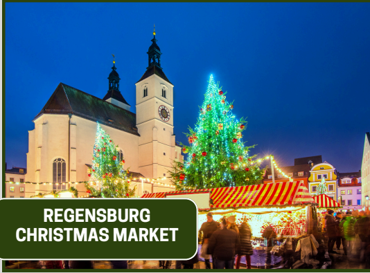
REGENSBURG CHRISTMAS MARKET

REGENSBURG IS ONE OF GERMANY'S BEST-PRESERVED MEDIEVAL CITIES, AS WELL AS A UNESCO WORLD HERITAGE SITE. JOIN A GUIDED WALKING TOUR SHOWCASING THE CITY'S ARCHITECTURAL HIGHLIGHTS, INCLUDING THE OLD TOWN HALL AND THE PORTA PRAETORIA, BEFORE VISITING THE OLD TOWN CHRISTMAS MARKET . AS AN ALTERNATE OPTION, SAMPLE