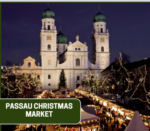
PASSAU CHRISTMAS MARKET

MAGNIFICENT CATHEDRAL, AND ITS CHRISTMAS MARKETS, INCLUDING THE HELLBRUNN PALACE , WHERE ITS INNER COURTYARD IS TURNED INTO A ROMANTIC BACKDROP FOR ONE OF THE MOST BEAUTIFUL CHRISTMAS MARKETS IN AUSTRIA. (B, L, D)