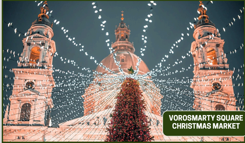
VOROSMARTY SQUARE CHRISTMAS MARKET

YOU CANNOT HELP BUT FALL IN LOVE WITH BUDAPEST , KNOWN AS THE “QUEEN OF THE DANUBE.” YOUR CITY TOUR BEGINS WITH A VISIT TO THE GREAT MARKET HALL. THE REMAINDER OF THIS TOUR TAKES YOU TO THE BUDA (HILLY) SIDES OF THE RIVER. AFTERWARD, YOU’LL VISIT VOROSMARTY SQUARE , THE OLDEST, RICHEST, AND THE MOST SPECTACULAR OF ALL THE CHRISTMAS MARKETS IN BUDAPEST. ALTERNATIVELY, HIKE UP TO CASTLE HILL FOR BREATHTAKING VIEWS OF THE CITY. (B, L, D)