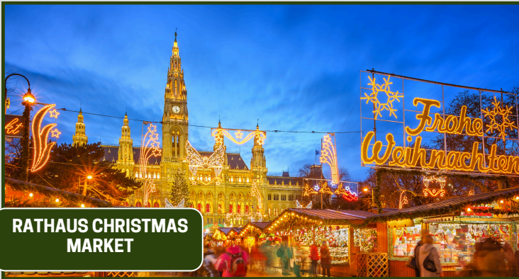
RATHAUS CHRISTMAS MARKET

THE “ CITY OF WALTZES ” OFFERS A TREASURE TROVE OF GEMS JUST WAITING TO BE DISCOVERED. JOIN A TOUR SHOWCASING ITS REGAL SPLENDORS, SUCH AS THE MAJESTIC OPERA HOUSE AND THE FORMER IMPERIAL PALACE OF THE HABSBURGS BEFORE CONCLUDING IN VIENNA’S HISTORIC CITY CENTER. AFTERWARD, YOU’LL VISIT THE CHRISTMAS MARKETS WHERE YOU CAN PURCHASE DELIGHTFUL DELICACIES AND HAND-MADE GIFTS. IN THE AFTERNOON, VISIT SCHÖNBRUNN PALACE CHRISTMAS MARKET AND ITS SPECTACULAR FESTIVE ATMOSPHERE. CAP THE DAY OFF AT THE BEAUTIFULLY DECORATED TOWN HALL (RATHAUS), VIENNA’S LARGEST CHRISTMAS MARKET . (B, L, D)